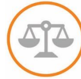
Suppliers, contractors, customers