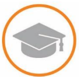
Universities, colleges, employment centers